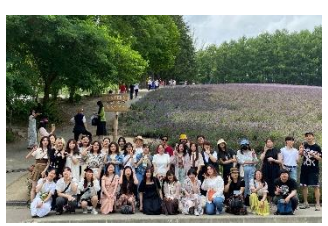
ct G Y