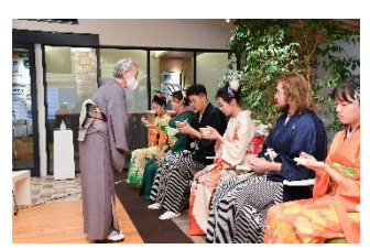
ct ct ct